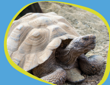
Sebastian the North American Desert Tortoise